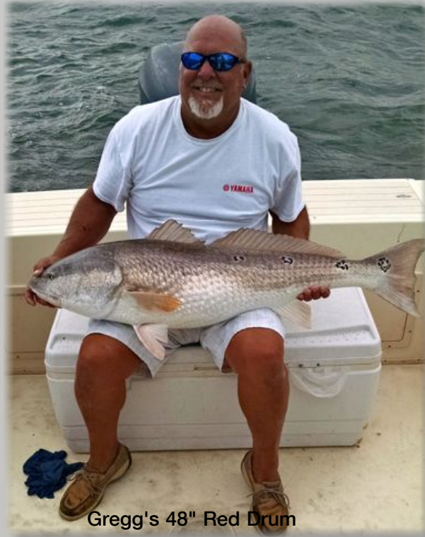
Gregg's 48" Red Drum